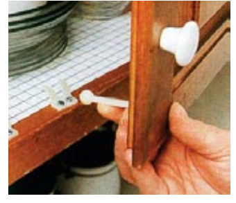
Cabinet doors. Install child-safety latches on all cabinet doors to prevent contents from falling out.

Statistically, you're most likely to be in your bedroom when a quake hits. Make sure nothing can fall onto any beds or crib in the house. Remove or block casters. Keep beds away from windows, and use window coverings to deflect flying glass. Security film will strengthen glass and keep windows from shattering into the room.