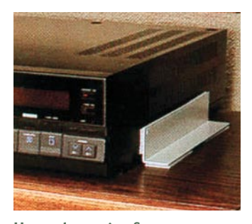
Home electronics. Secure computers, televisions, stereo equipment, and microwaves with flexible straps with buckles (for easy removal).