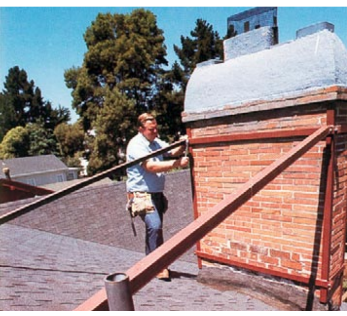
Steel frame. Braced chimney has a collar to hold it together and braces to keep it from coming down.

don't nail or you'll knock plaster off old ceilings or pop nails in newer ones. Lay down plywood from the chimney to a distance 11/2 times its height (measure from the joist to the top).