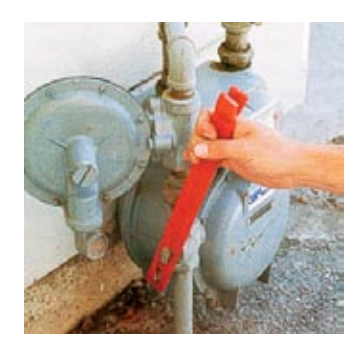
Gas. Shut off gas at the meter only if you suspect a leak.