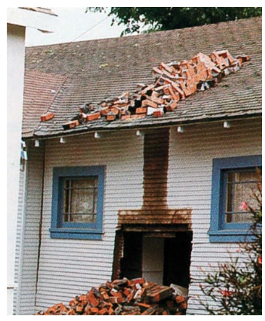
Failed masonry. Before this chimney collapsed, it first snapped at the roof line.