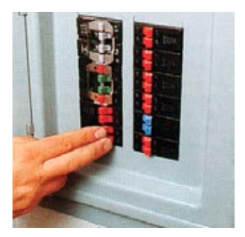
Electricity. Flip off breakers if you find fallen or loose wires or appliance damage, or if you smell burning insulation.