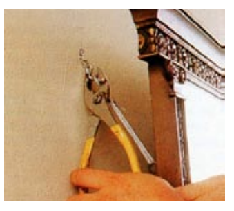
Hanging objects. Affix to walls with "closed hooks." Display only unframed art or textiles above beds or places where people sit.