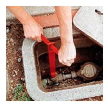
Water. If your water lines are broken, shut off water at the main valve at the street.